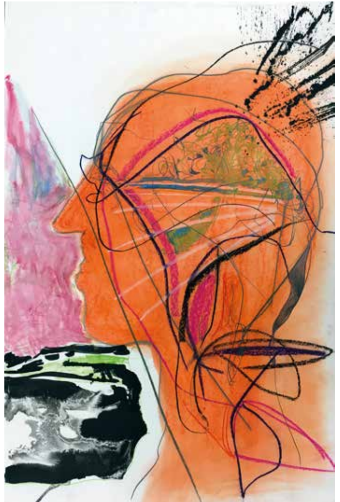
Untitled Justin Earl Grant Ink, pastel and graphite on paper 24 by 36 in 2018