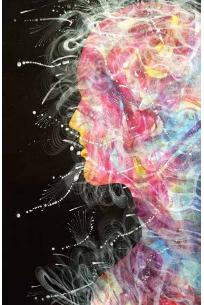
Identity Series Mauricio Paz Viola Acrylic and pastel on paper 24 by 36 in 2018