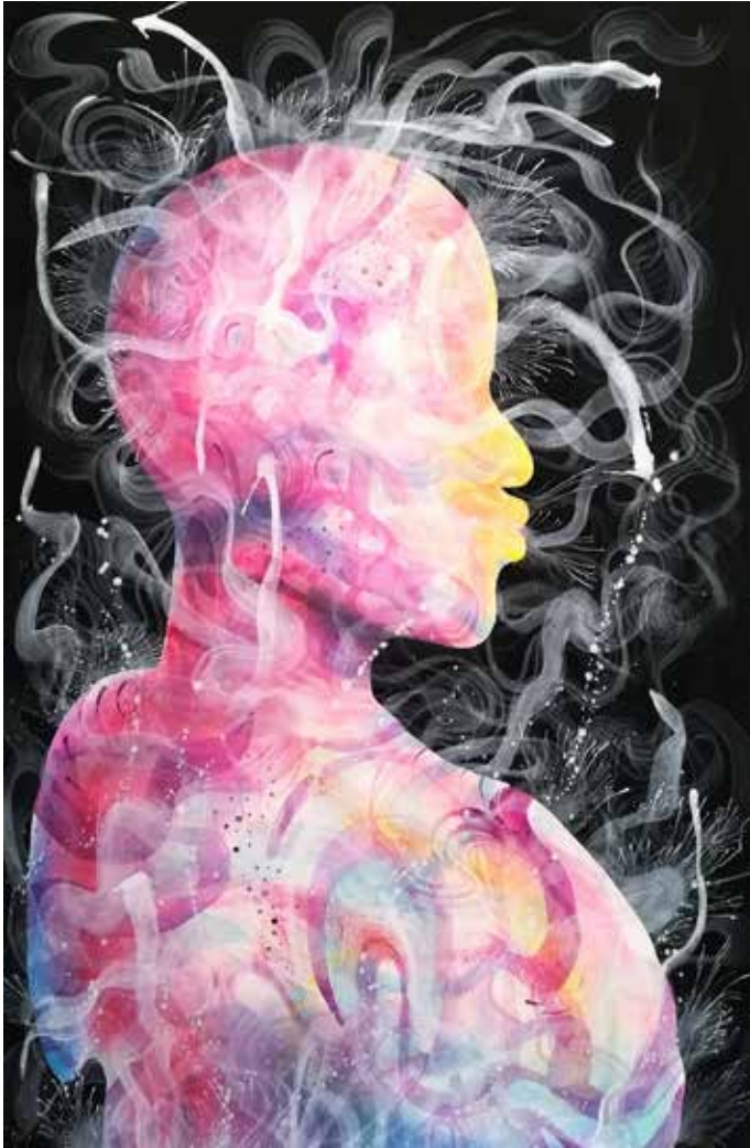
Identity Series Mauricio Paz Viola Acrylic and pastel on paper 24 by 36 in 2018