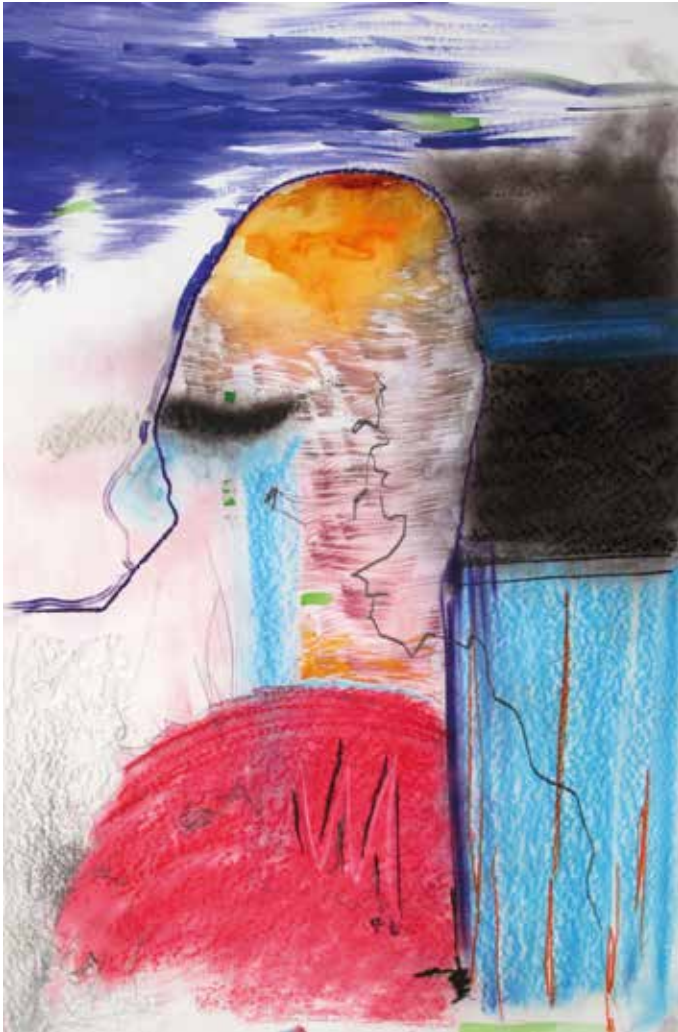
Untitled Justin Earl Grant Ink, graphite and pastel on paper 24 by 36 in 2018