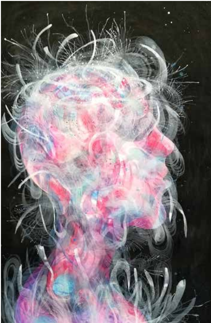
Identity Series Mauricio Paz Viola Acrylic and pastel on paper 24 by 36 in 2018