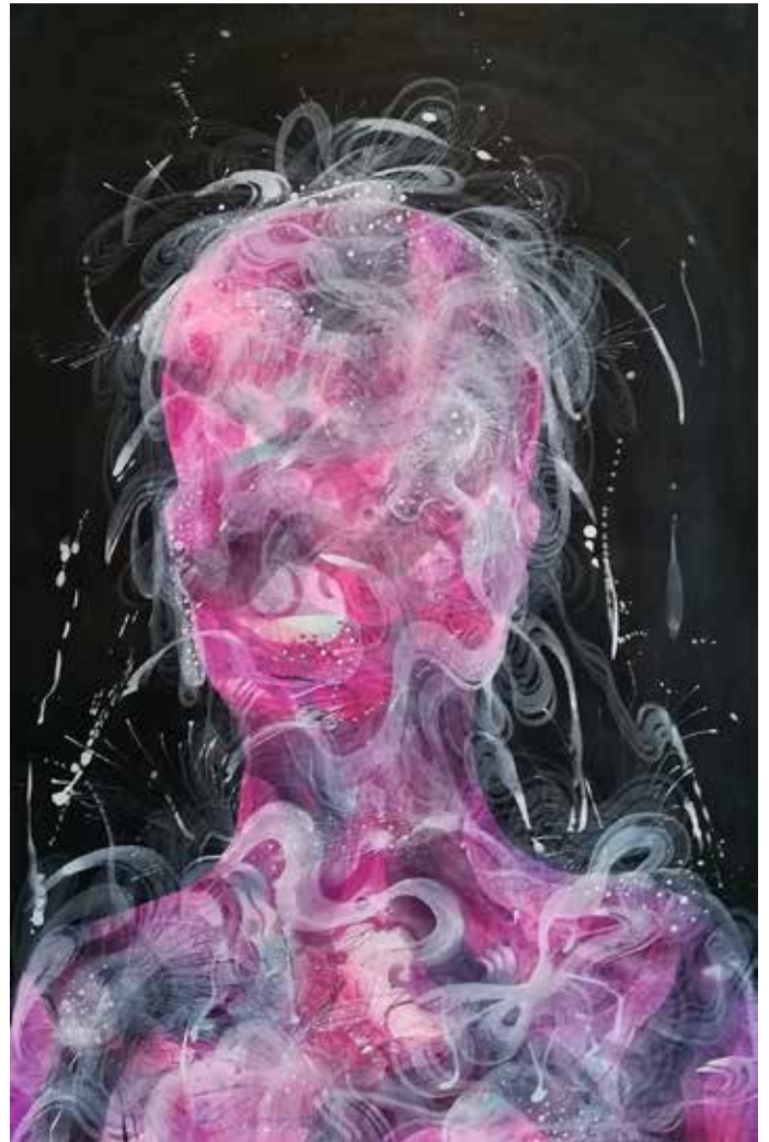
Identity Series Mauricio Paz Viola Acrylic and pastel on paper 24 by 36 in 2018