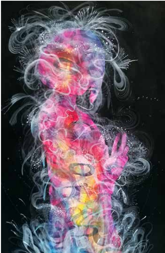
Identity Series Mauricio Paz Viola Acrylic and pastel on paper 24 by 36 in 2018