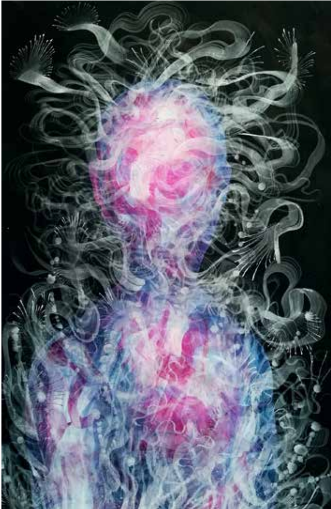
Identity Series Mauricio Paz Viola Acrylic and pastel on paper 24 by 36 in 2018