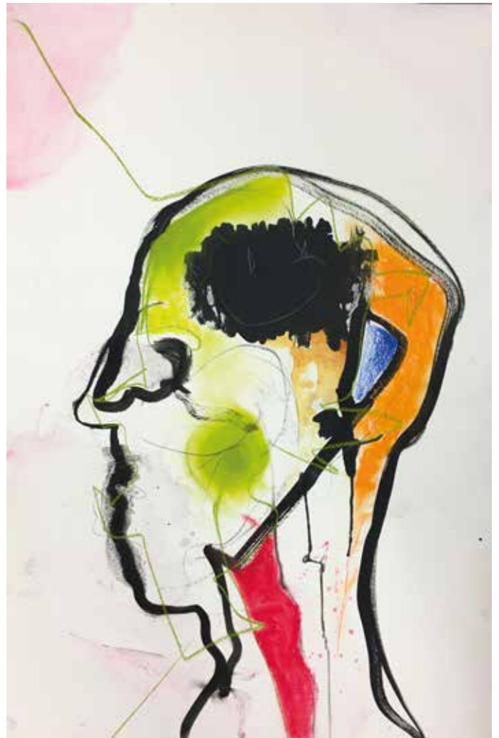
Untitled Justin Earl Grant Ink, graphite and pastel on paper 24 by 36 in 2018