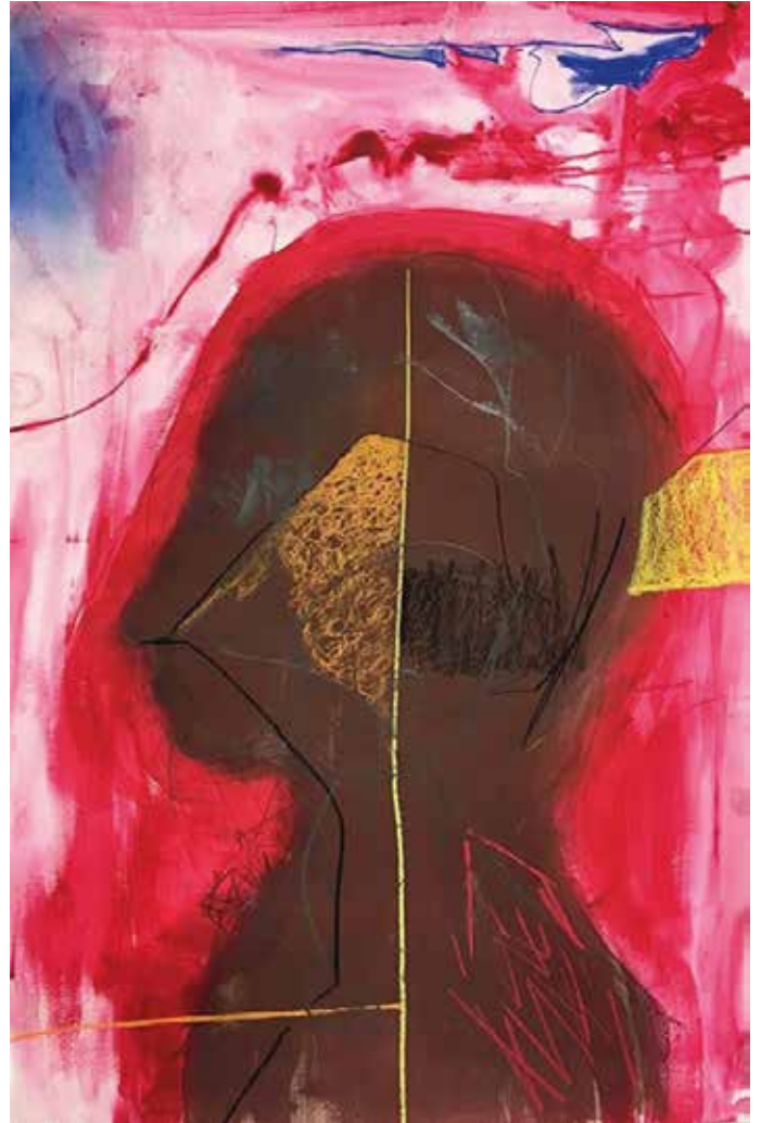
Untitled Justin Earl Grant Pastel, graphite and acrylic on paper 24 by 36 in 2018